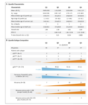
Figure 2. Defining Characteristics and Subtype Composition of the Study Quartiles for Patients with Chronic Granulomatous Disease

Characteristics of the study quartiles are listed in Panel A. The subtype composition of each quartile is shown in Panel B. Differences in the proportion of the subtypes in the quartiles were determined with the use of a chi-square test for trend. Orange blocks with an upward slope indicate significant increases in subtype composition, and blue blocks with a downward slope significant decreases in subtype composition. Patients with gp91 phox chronic granulomatous disease were divided into two subgroups: one for patients with nonsense, frameshift, splice, or deletion mutations and another for patients with missense mutations. Patients with missense mutations were further divided into two additional subgroups: one for patients with missense mutations in amino acids 1 through 309 (except His222) and another for patients with missense mutations in amino acids 310 through 570 (plus His222). The numbers in parentheses in the row for gp91 phox , columns for Q2, Q3, and Q4, refer to patients whose mutations in gp91 phox could not be determined with the use of standard approaches.