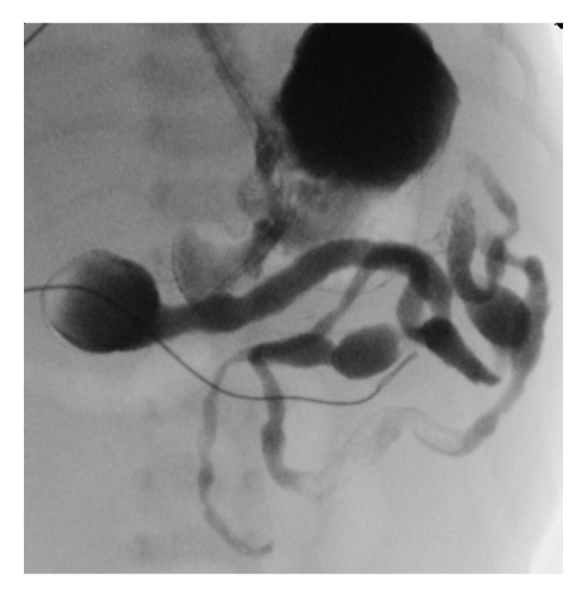
Fig. 2 Upper GI with small bowel follow-through at 4 weeks of age. Featureless bowel proximally with thickened folds distally. Poor peristaltic activity noted during this examination.

Persistent, unexplained inflammation in the GI tract led to continued high GI fluid output. \alpha -1 antitrypsin from stool samples was elevated (1.00; rr = 0.00-0.62 mg/g). Clostridium difficile toxin was negative. Fecal calprotectin was also elevated at 391 (rr = 51-120 µg/g). Electron microscopy of endoscopic biopsies obtained at 7 weeks of age revealed degenerative changes in the epithelium and structural irregularities of the microvilli consistent with an ongoing, acute ulcerative process; and inflammatory changes were observed by light microscopy.